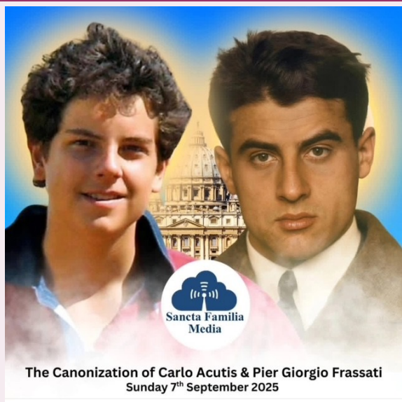
The Canonization of Carlo Acutis & Pier Giorgio Frassati Sunday 7 th September 2025

160 Court St 716-854-2563 StAnthonyBuffalo@yahoo.com