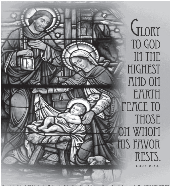
Excerpts from the Lectionary for Mass ©2001, 1998, 1970 C.C.D.

Saturday ..... 4:00 p.m. (Sunday Liturgy) Sunday..... 9:00 a.m. and 11:00 a.m. Eve of the Holy Day..... 4:30 p.m. Holy Day ..... 12:05 p.m. Mon-Fri ..... 12:05 p.m. Confessions ..... Saturday 3:15 - 3:45 p.m.