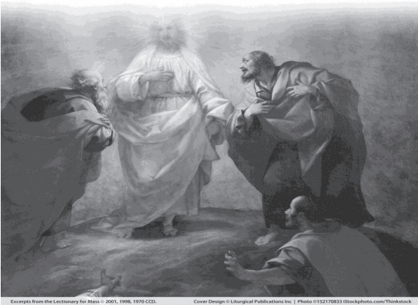
Excerpt from the Lectionary for Mass • 2001, 1998, 1970 CCD.

While he was still speaking, a cloud came and cast a shadow over them, and they became frightened when they entered the cloud. Then from the cloud came a voice that said, "This is my chosen Son; listen to him." — Lk 9:34-35